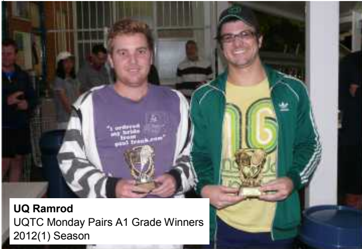
UQ Ramrod UQTC Monday Pairs A1 Grade Winners 2012(1) Season