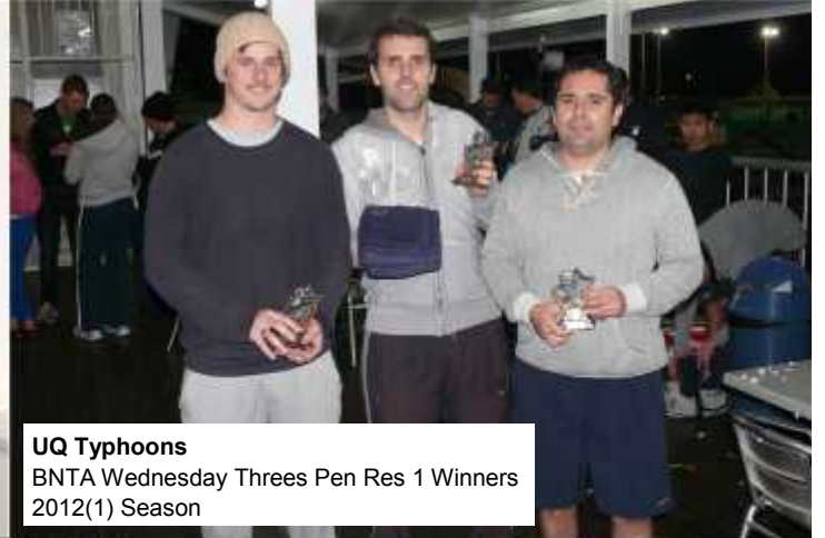
UQ Typhoons BNTA Wednesday Threes Pen Res 1 Winners 2012(1) Season