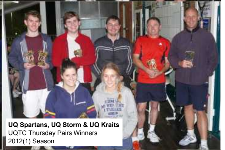
UQ Spartans, UQ Storm & UQ Kraits UQTC Thursday Pairs Winners 2012(1) Season