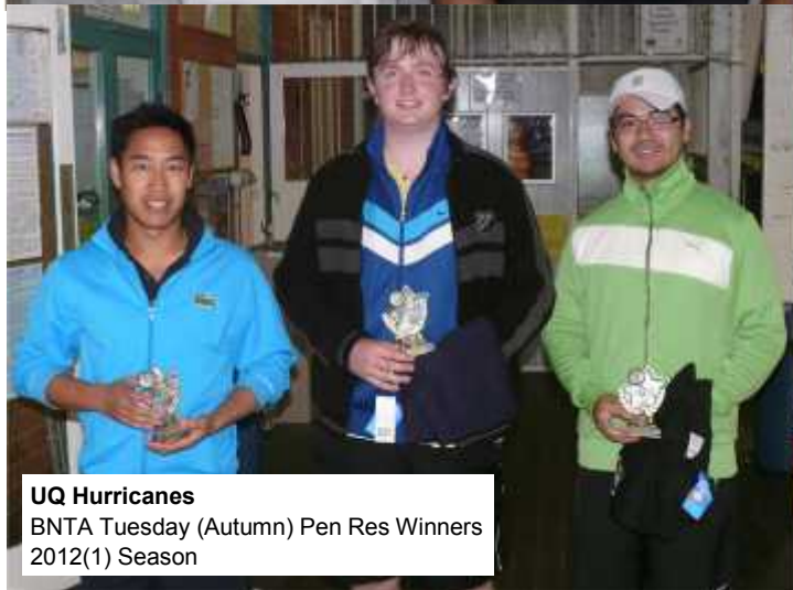
UQ Hurricanes BNTA Tuesday (Autumn) Pen Res Winners 2012(1) Season