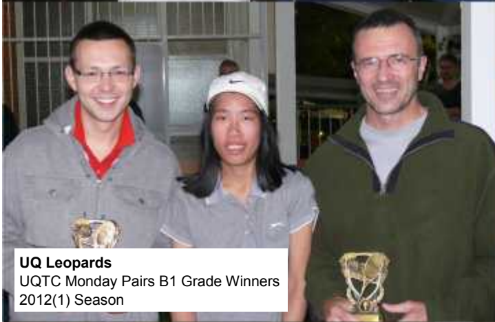
UQ Leopards UQTC Monday Pairs B1 Grade Winners 2012(1) Season