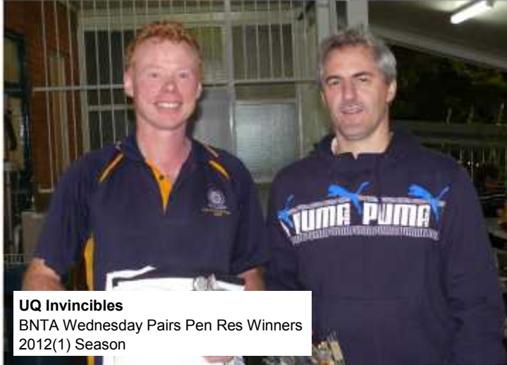
UQ Invincibles BNTA Wednesday Pairs Pen Res Winners 2012(1) Season