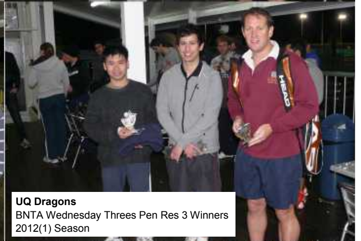
UQ Dragons BNTA Wednesday Threes Pen Res 3 Winners 2012(1) Season