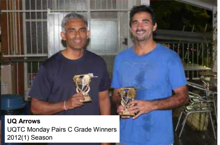
UQ Arrows UQTC Monday Pairs C Grade Winners 2012(1) Season