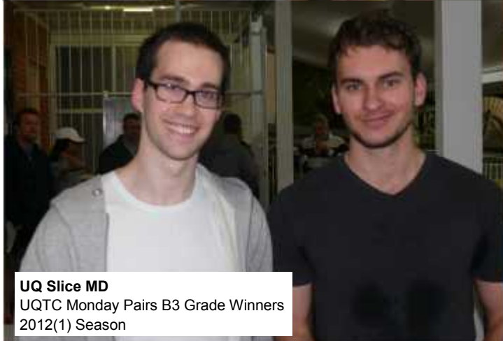
UQ Slice MD UQTC Monday Pairs B3 Grade Winners 2012(1) Season