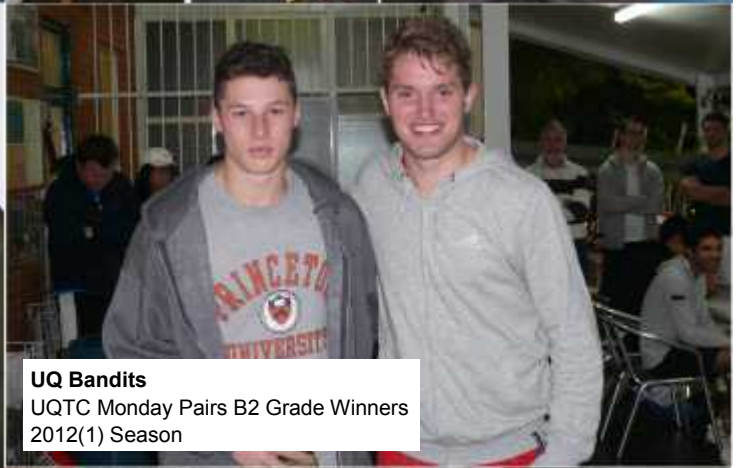
UQ Bandits UQTC Monday Pairs B2 Grade Winners 2012(1) Season