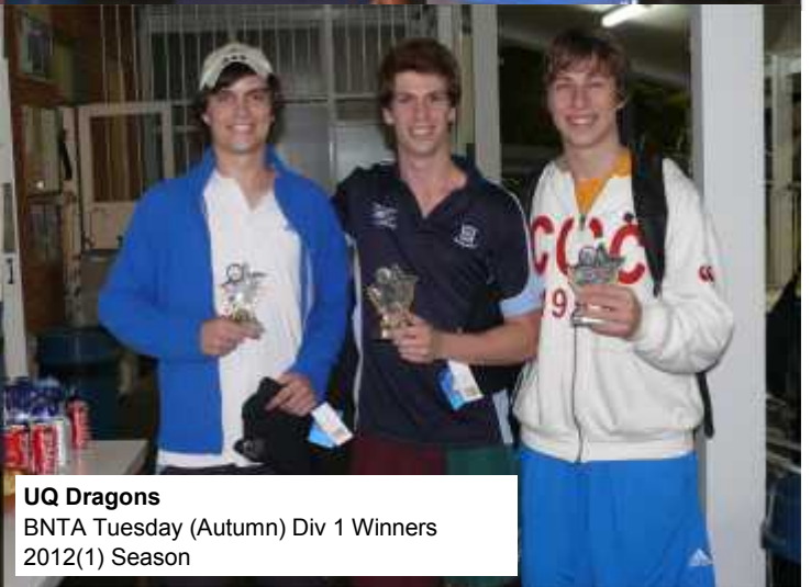
UQ Dragons BNTA Tuesday (Autumn) Div 1 Winners 2012(1) Season