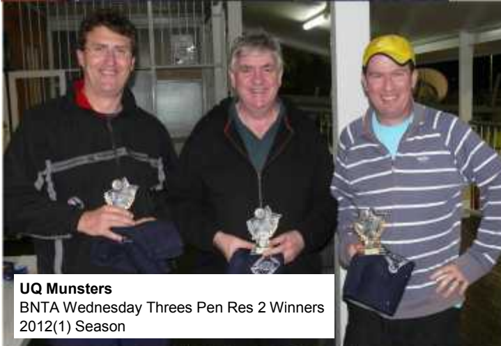
UQ Munsters BNTA Wednesday Threes Pen Res 2 Winners 2012(1) Season