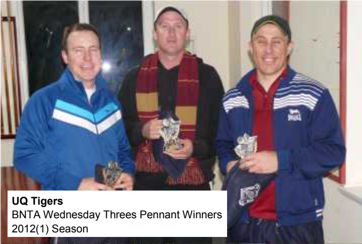
UQ Tigers BNTA Wednesday Threes Pennant Winners 2012(1) Season