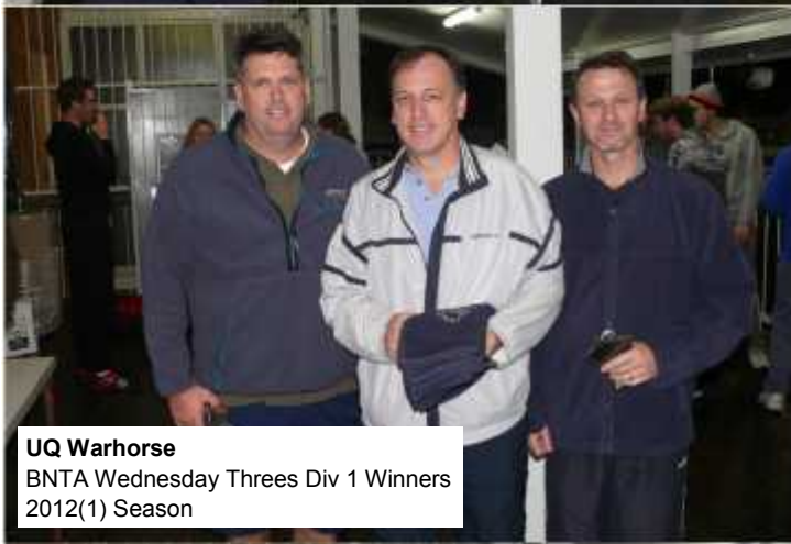
UQ Warhorse BNTA Wednesday Threes Div 1 Winners 2012(1) Season