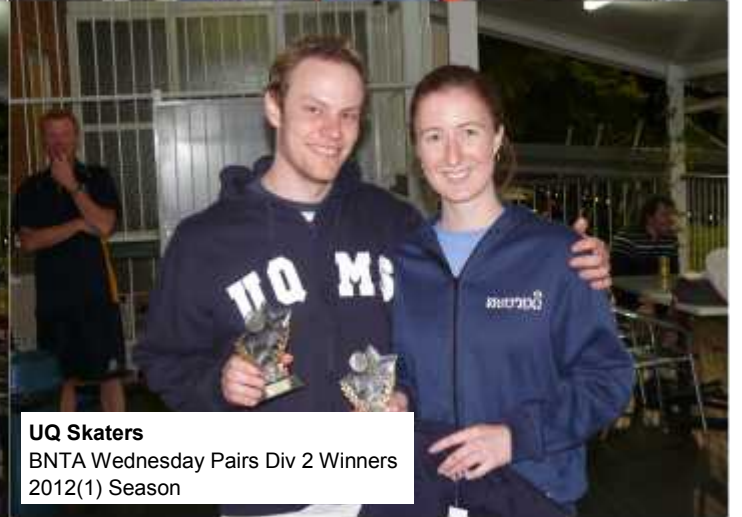
UQ Skaters BNTA Wednesday Pairs Div 2 Winners 2012(1) Season