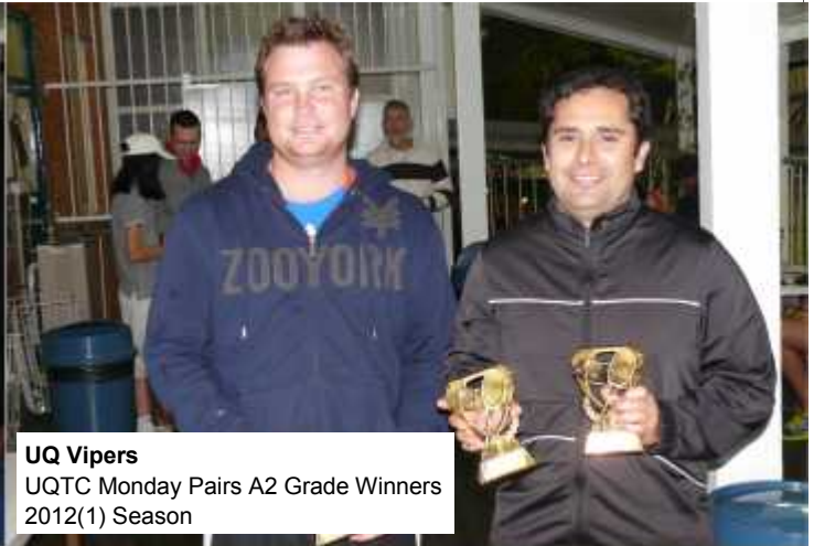
UQ Vipers UQTC Monday Pairs A2 Grade Winners 2012(1) Season