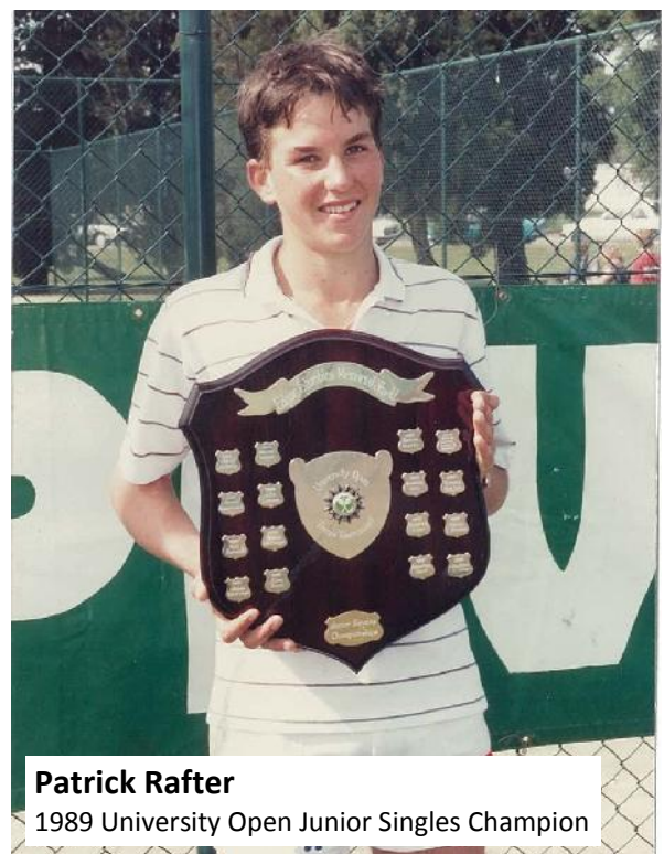
Patrick Rafter 1989 University Open Junior Singles Champion