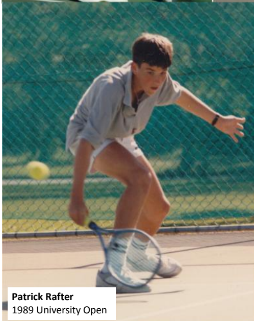
Patrick Rafter 1989 University Open