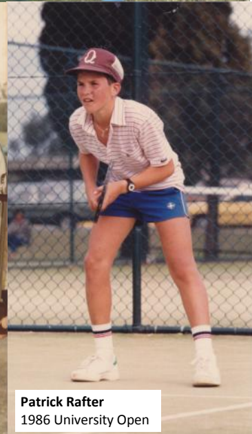
Patrick Rafter 1986 University Open