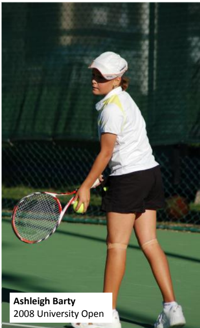
Ashleigh Barty 2008 University Open

* All sponsorship packages are flexible and open to negotiation as there could be alternative ways of promoting a sponsor's support of the tournament or some goods & services could be provided in lieu of cash. Costs involved in providing signs/banners, producing artwork for advertisements and printing advertising inserts are a cost of the sponsor, over and above the sponsorship amount.