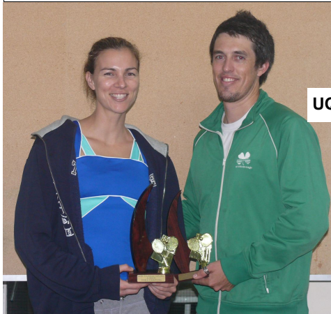
UQTC Thursday Finalists