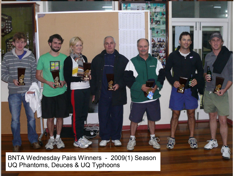
BNTA Wednesday Pairs Winners - 2009(1) Season UQ Phantoms, Deuces & UQ Typhoons