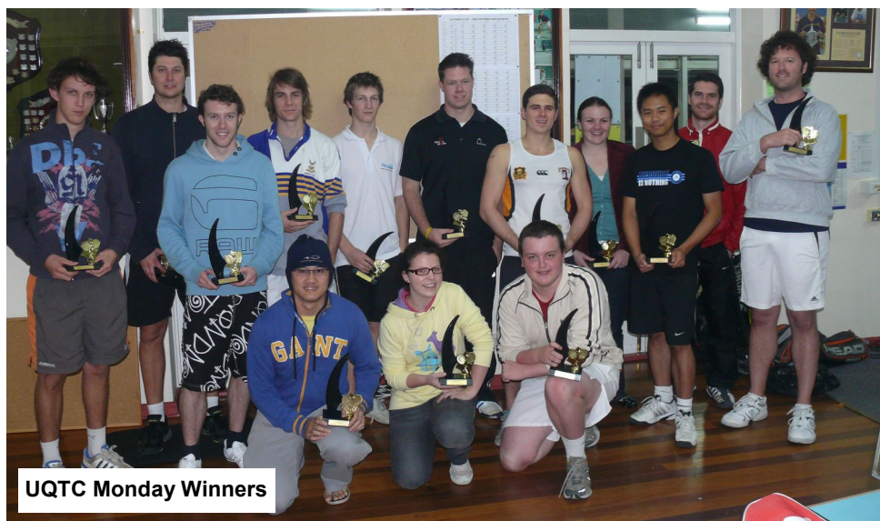
UQTC Monday Winners

If you are not receiving UQ Tennis E-News, please send your e-mail address to admin@uqtc.org.au .